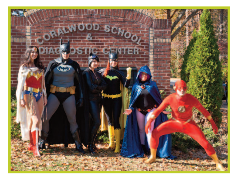
Heroes Alliance - Georgia

Super Heroes Day at Coralwood To celebrate reaching its goal in this year's Coralwood Challenge, the Coralwood Foundation treated the students to a special Super Heroes Day at Coralwood in November 2014! During the day, the students received a special classroom visit by several super heroes from Heroes Alliance - Georgia. The students were dressed as their favorite super hero for the day to welcome these exciting visitors to Coralwood.